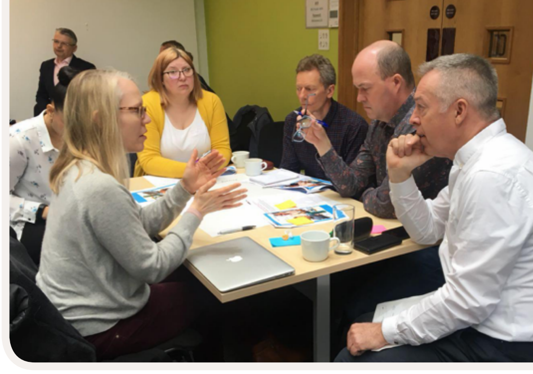
Delegates at one of the VCSE workshops