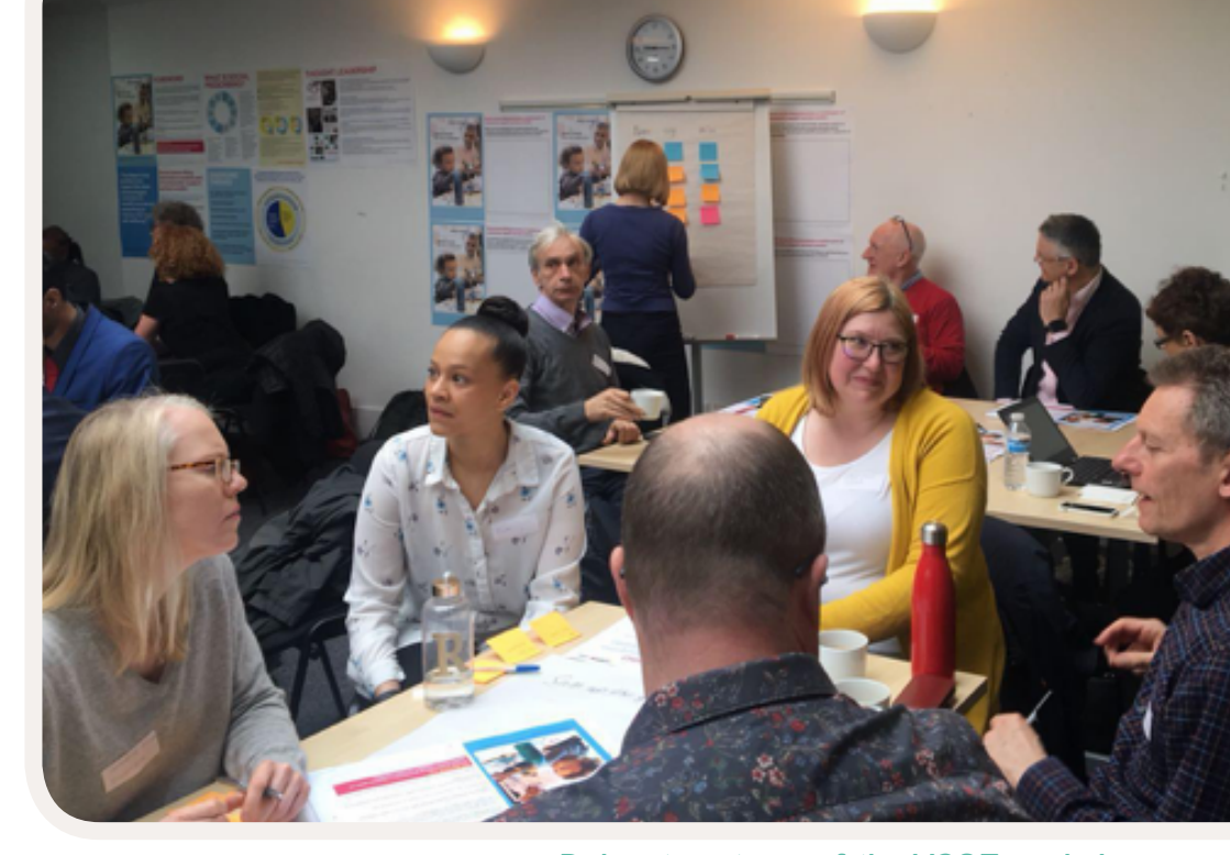
Delegates at one of the VCSE workshops

In the context of a Better Health For All Londoners , the provision of pan-London coverage of social welfare legal advice services can make a significant impact in addressing health inequalities in London, and may provide an exciting and suitable starting point for the Healthy London Fund supported by the Mayor of London.