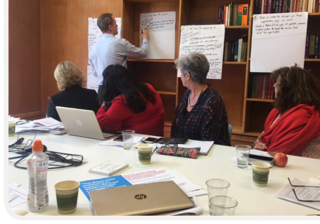
Social welfare advice thought-leaders meeting

The thought-leaders involved in the engagement around this report recognise the need to develop a flexible model that provides pan-London coverage of social welfare advice services over three levels: