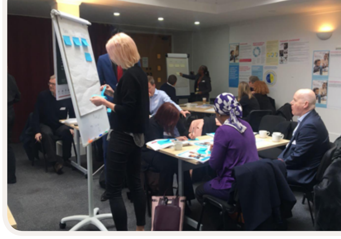
Delegates at one of the VCSE workshops

The answers to the future role of the VCSE sector in social prescribing lie in understanding the challenges and opportunities for the sector (section 3), the resources required for the sector to participate optimally in social prescribing (section 4), the sector's scope for meeting the needs of vulnerable groups (section 5), how the sector is engaged in social prescribing (section 6), and what role the GLA and the Mayor may take in acting as a champion (section 7).