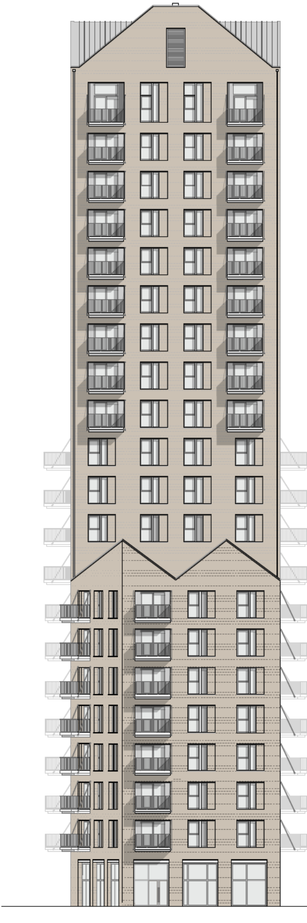
Block A: south elevation