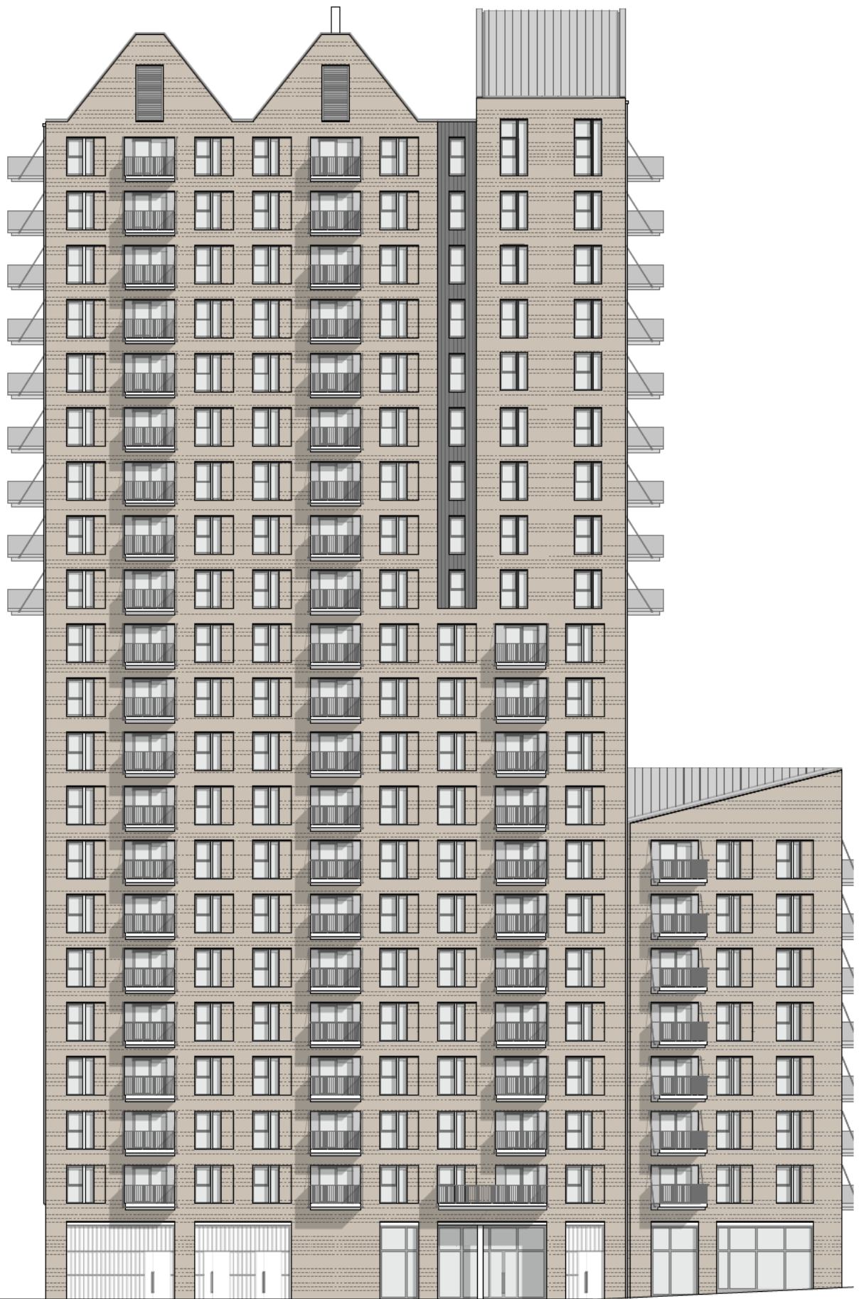
Block A: west elevation