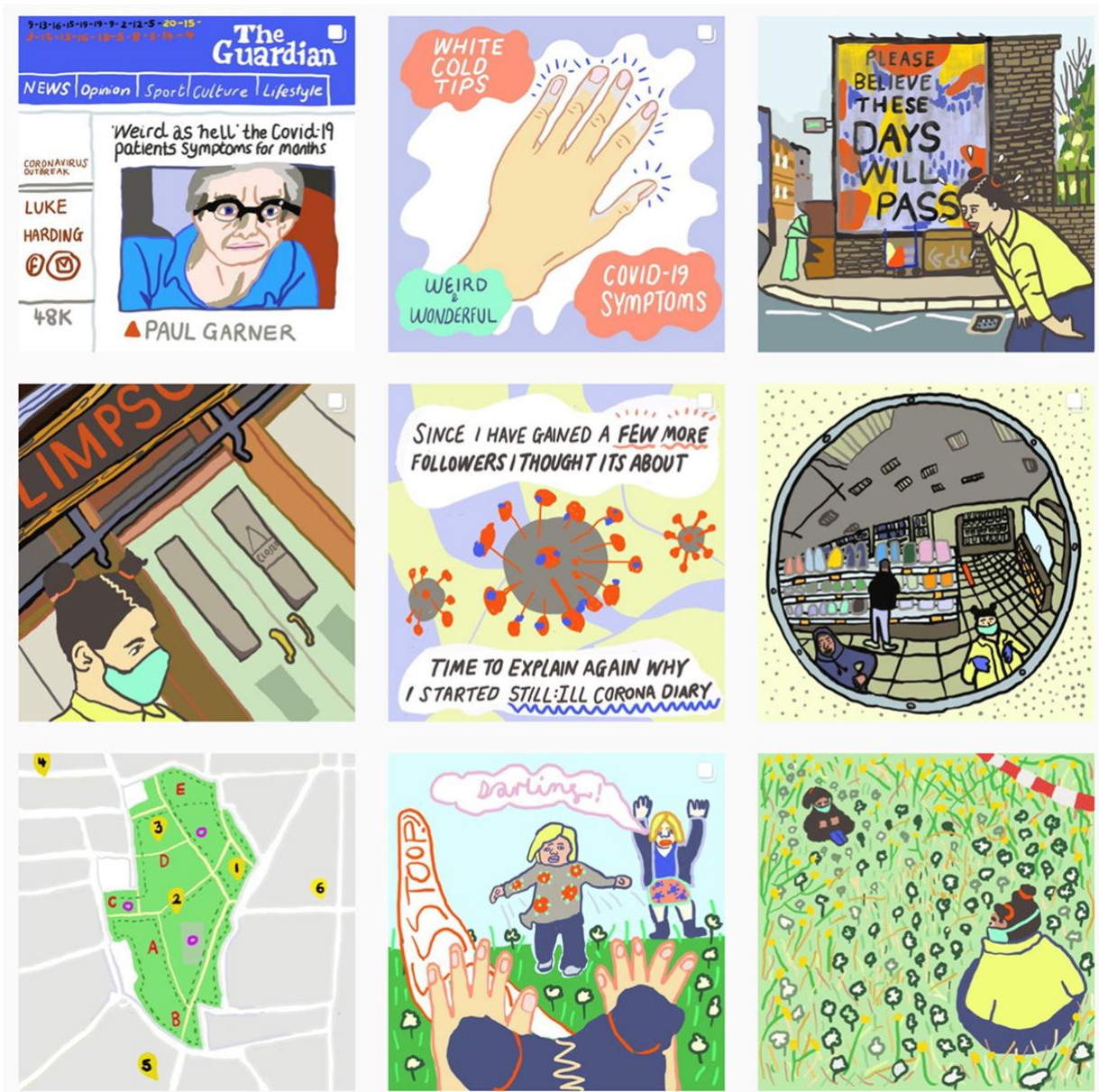
Figure 1: Illustrations from Still Ill Corona Diary, A COVID-19-19 Graphic Journal, ©Monique Jackson, Instagram: @_coronadiary