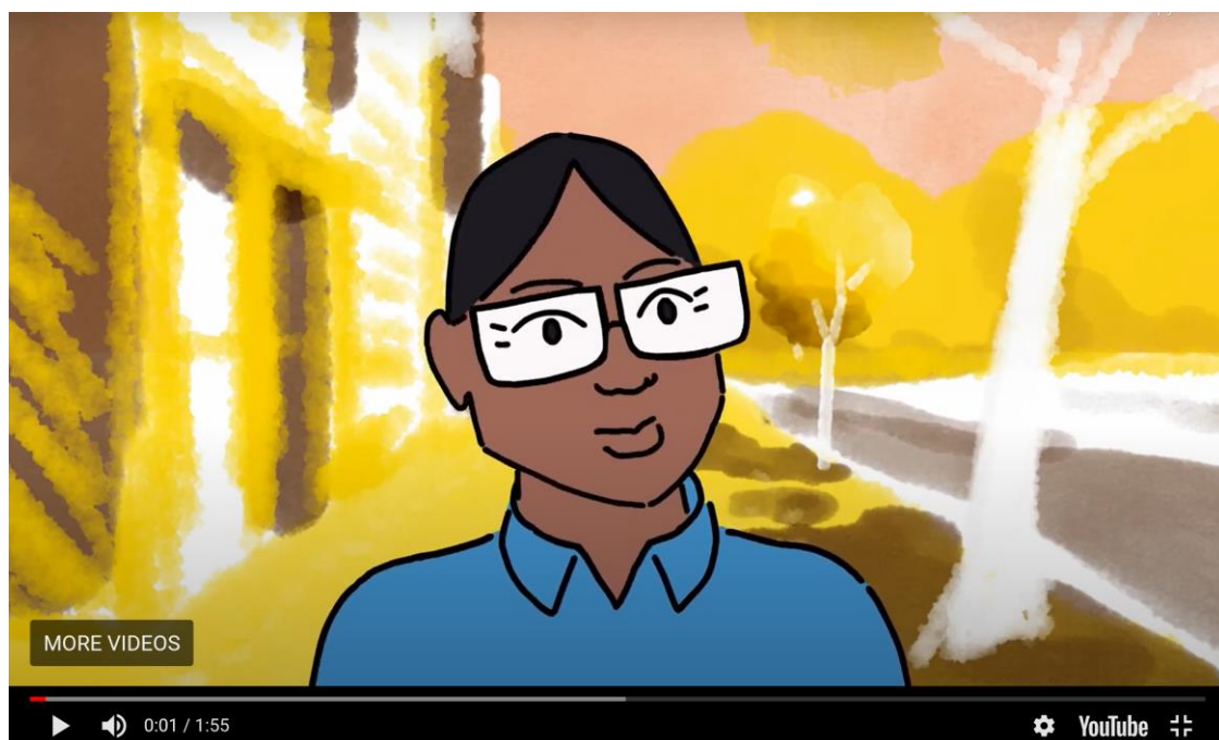
Figure 2b: Screenshot from 'Let's Talk Mental Health' film, https://youtu.be/wSSpwqakw-Q