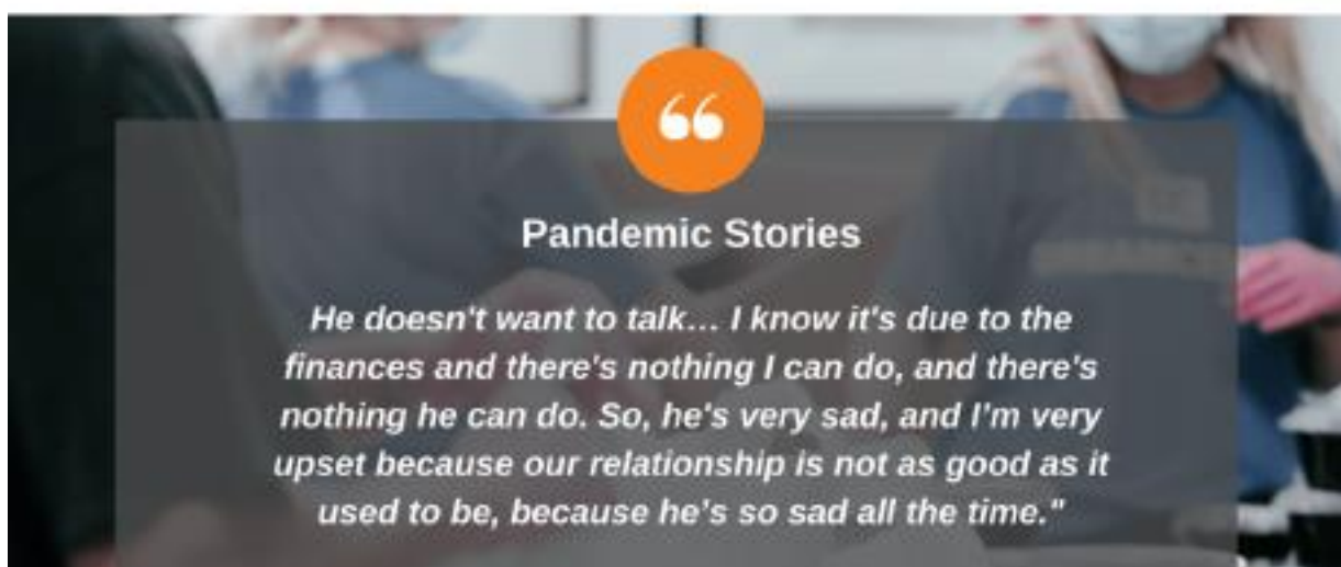
Figure 6: Quotes from the Pandemic Stories project interviews