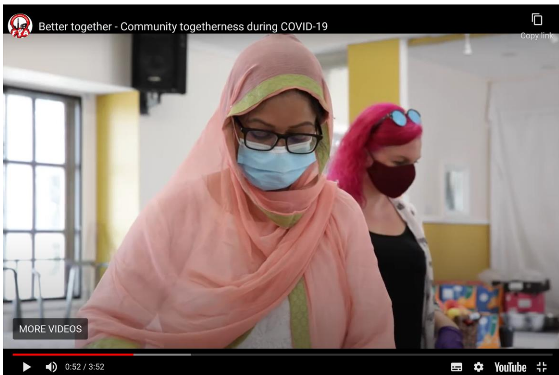
Figure 3a: Screenshot from 'Better Together' film, https://youtu.be/-qegkvnQzTA