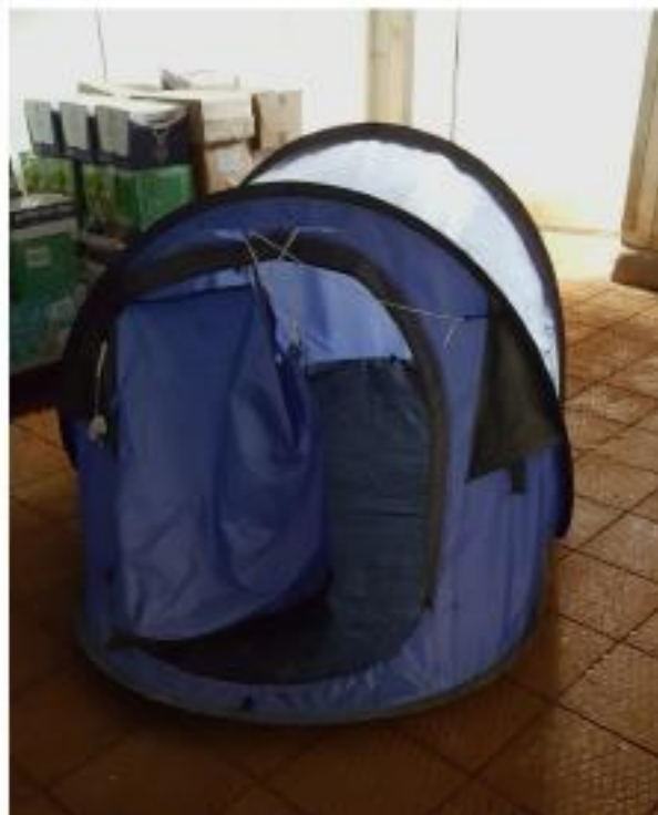
Figure 5a: Membership card for users of Pepys Social Supermarket in Pepys Estate, Deptford © Museum of London, Figure 4b: Wooden spoon from Baguio, Philippines, used at donor's home in Camberwell to cook meals for Filipino Food for NHS Staff initiative © Museum of London, Figure 4c: Tent used at Project Parker, Walthamstow © Museum of London