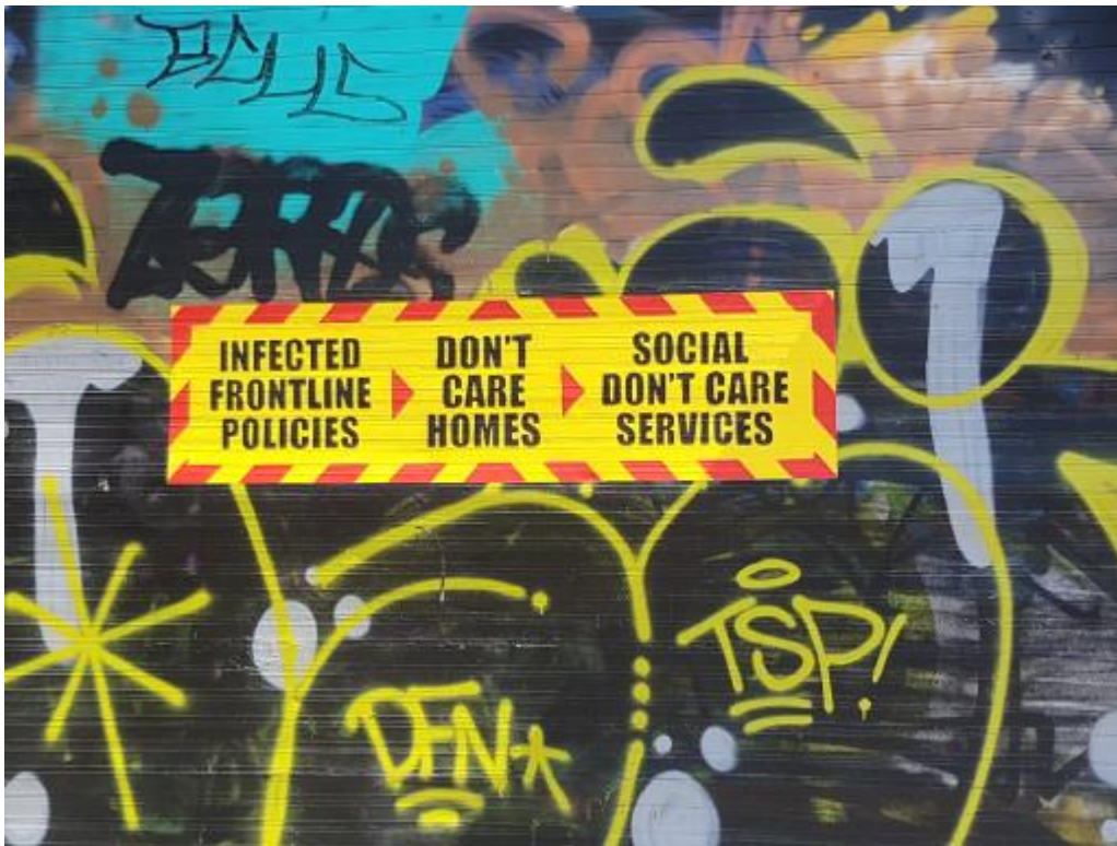
Figure 4a: Graffiti, P_COV_2_10_3, © Tower Hamlets Local History Library and Archives