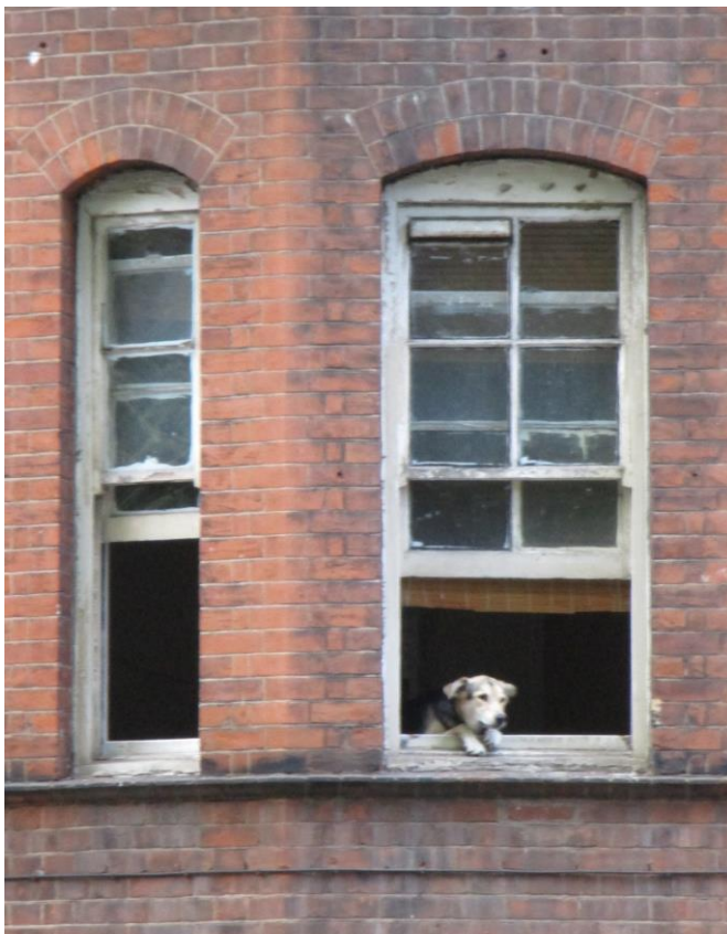
Figure 3b: Lockdown Dog, P_COV_18_3, © Tower Hamlets Local History Library and Archives