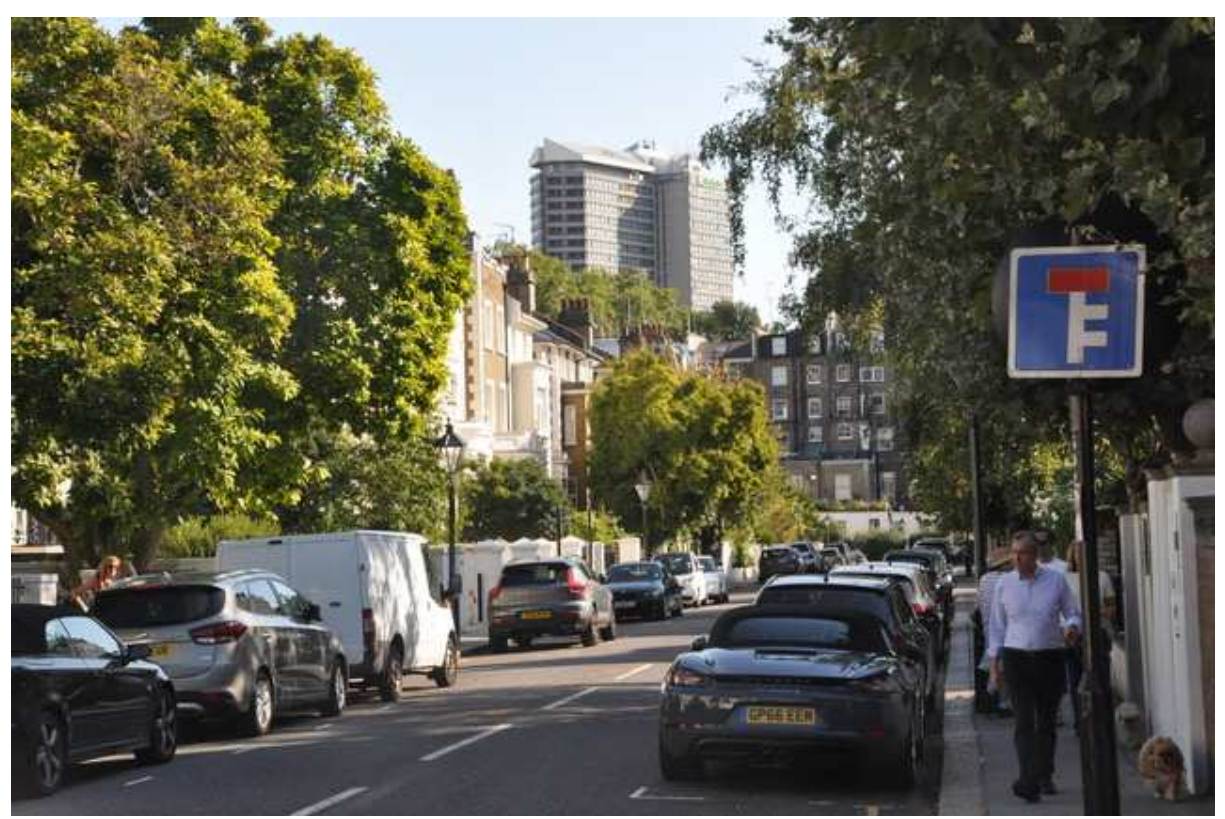
Victoria Road at St Alban's Grove: 50mm