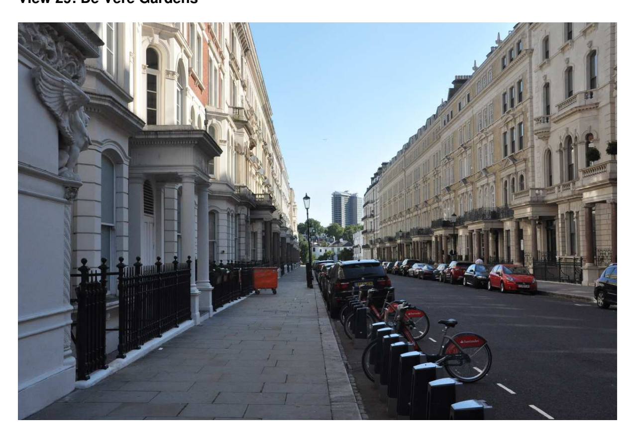
De Vere Gardens (northern end): 24mm lens