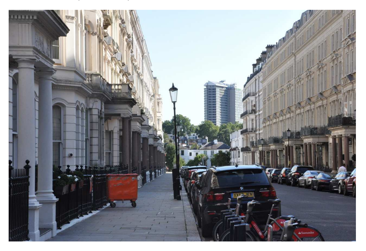
De Vere Gardens (northern end); 50mm lens