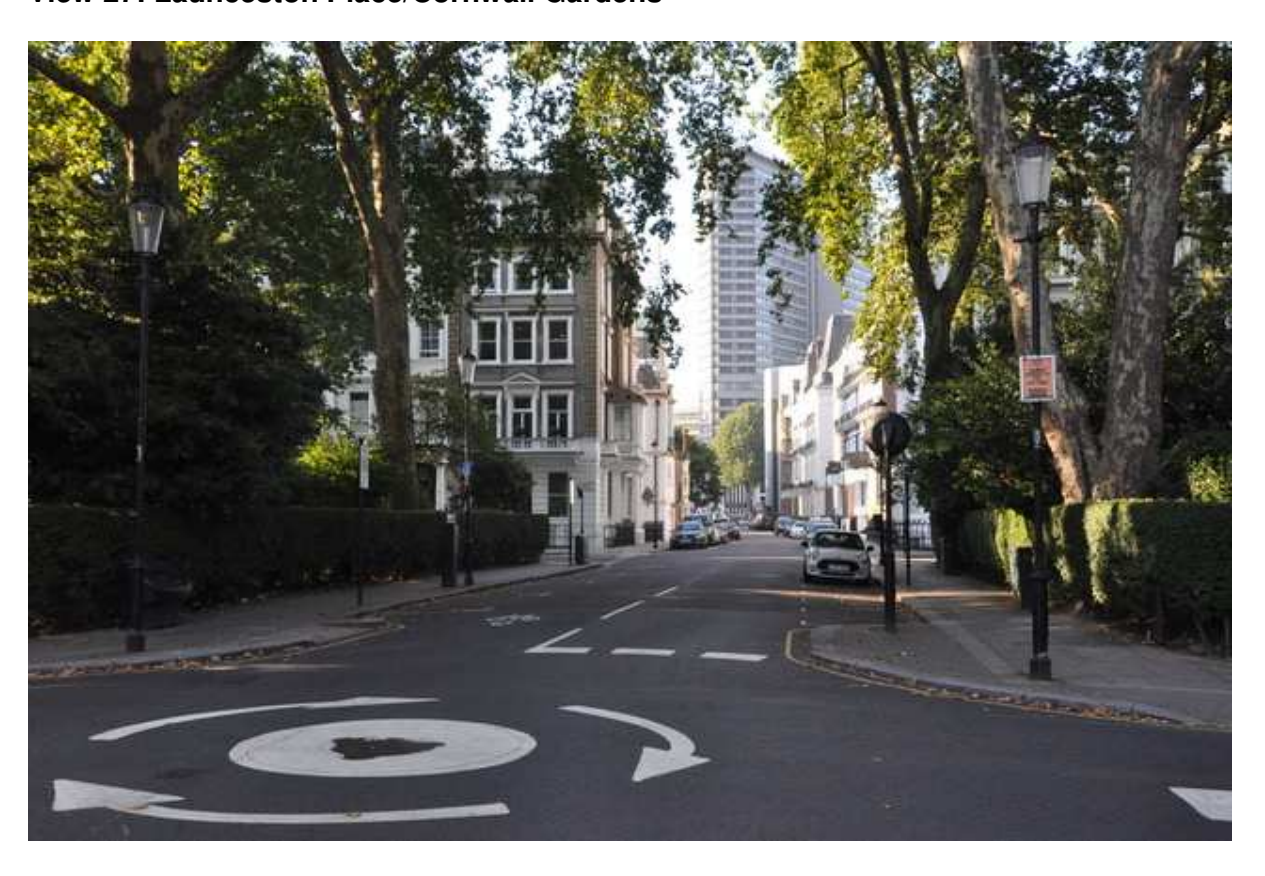
Launceston Place/Cornwall Gardens: 24mm lens