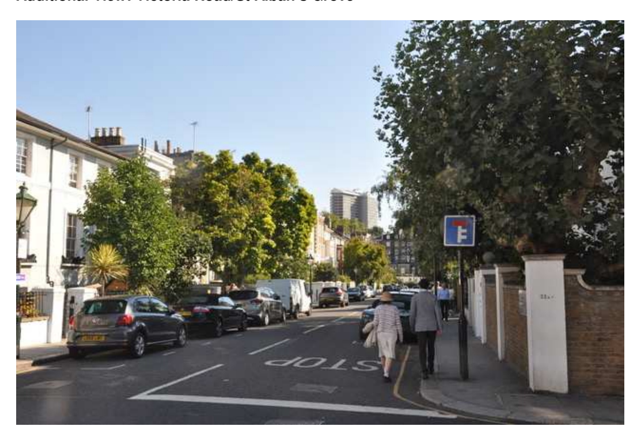
Victoria Road at St Alban's Grove: 24mm