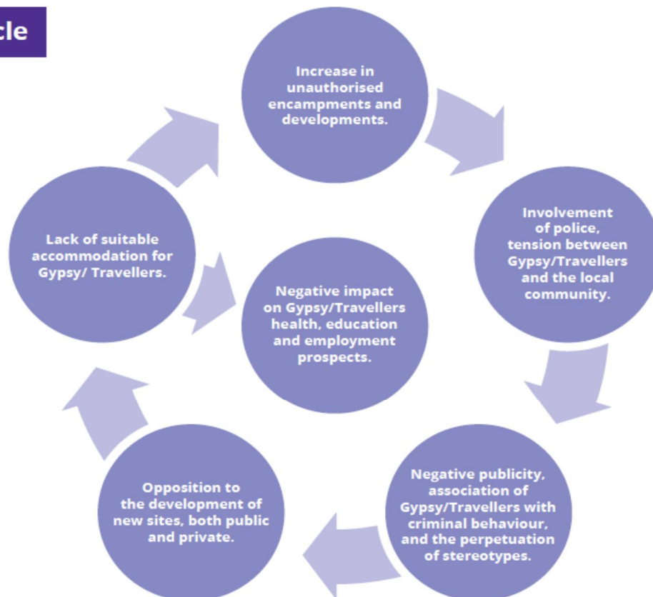
Fig.6.1: Vicious Circle from Gypsy/Travellers and the Scottish Planning System: A Guide for Local Authorities , published by PAS (Planning Aid for Scotland)

Allegations of criminality against Gypsies and Travellers are also commonplace. Whilst there is no evidence that Gypsies and Travellers have higher levels of criminality than the wider community, there will always be a small minority who do use criminal or antisocial behaviour. It could also be argued that legal, social and economic changes (see Section 2.2) have made it harder for Gypsies and Travellers to make their living in traditional ways, hence pushing them to the “fringes” of legal income. It is more likely however that isolated examples of where this occurs are more visible than they would be for other communities, again helping to fuel prejudice against Gypsies and Travellers.