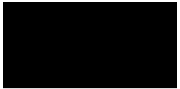
Mayor's Design Advocate